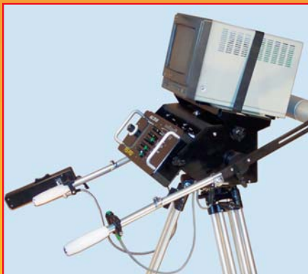
Pan bar control