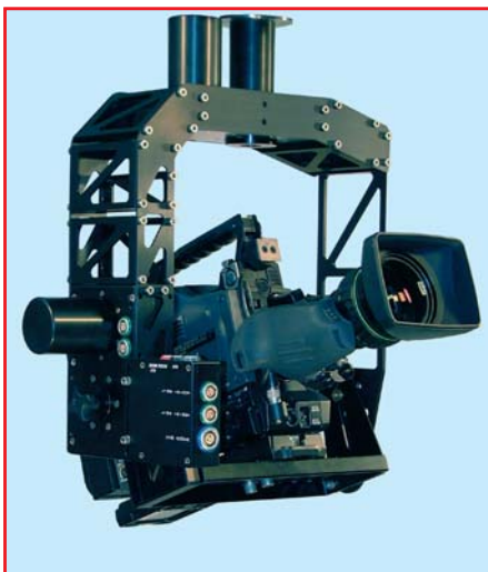
JIB ARM Format (2 Axis)

The PEE-POD 500 is the latest exciting development to come from A&C's dedication to professional performance and innovative technology. This lightweight remote camera head with a large budget specification, boasts a low budget cost.