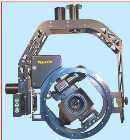
JIB ARM Format (3 Axis)