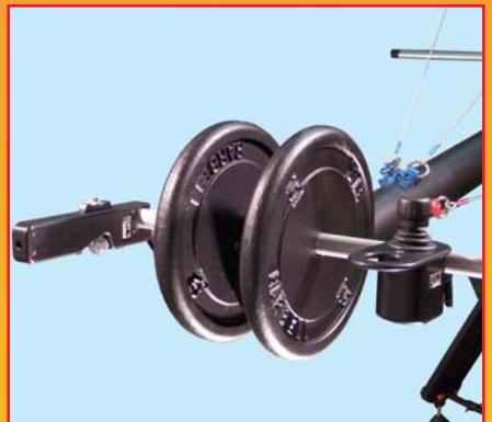
One man operation